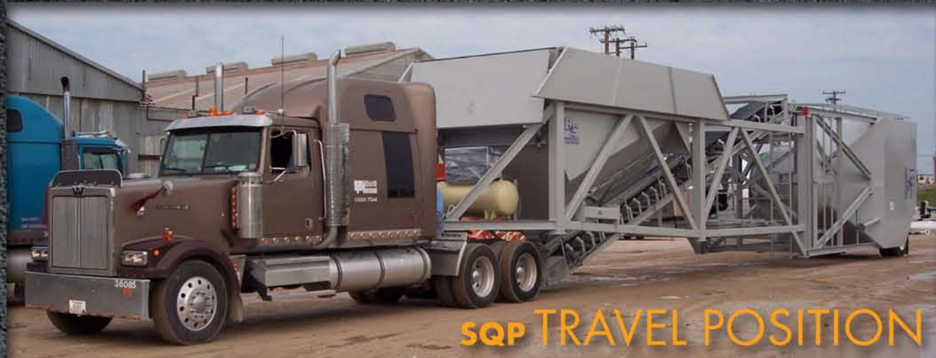
SQP TRAVEL POSITION