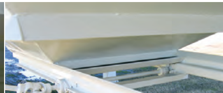
30" x 30" hopper doors