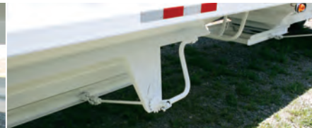
Fold down crank handles

Also available: Additional side heights (72", 78") Additional lengths A variety of tarp colors Stripe